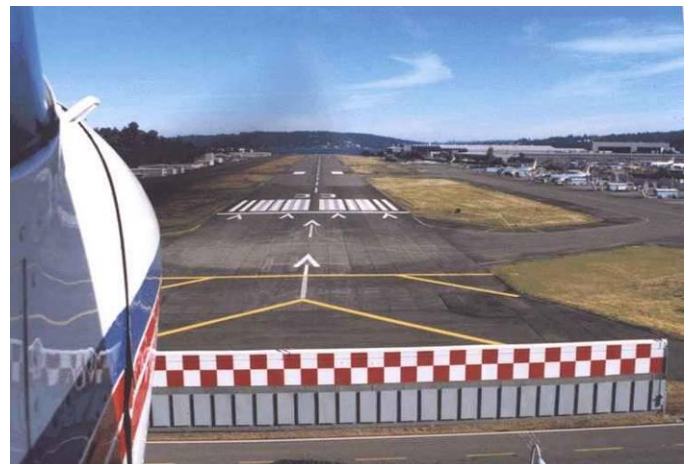
On final approach to RNT